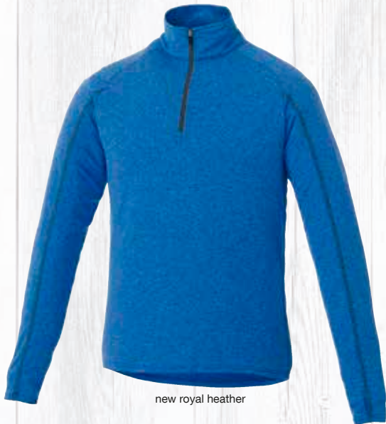
new royal heather