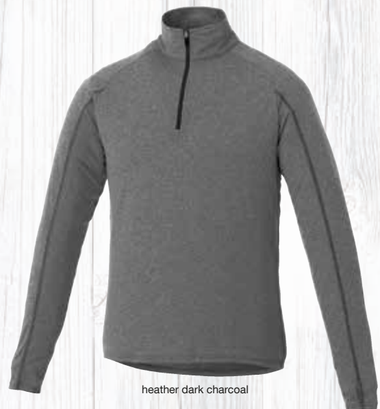
heather dark charcoal