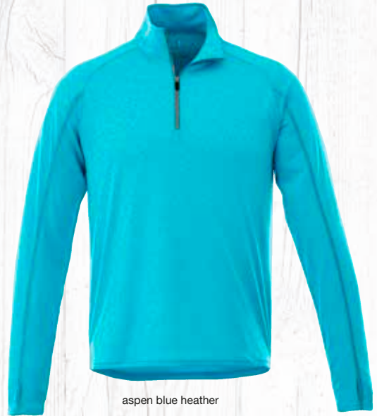
aspen blue heather