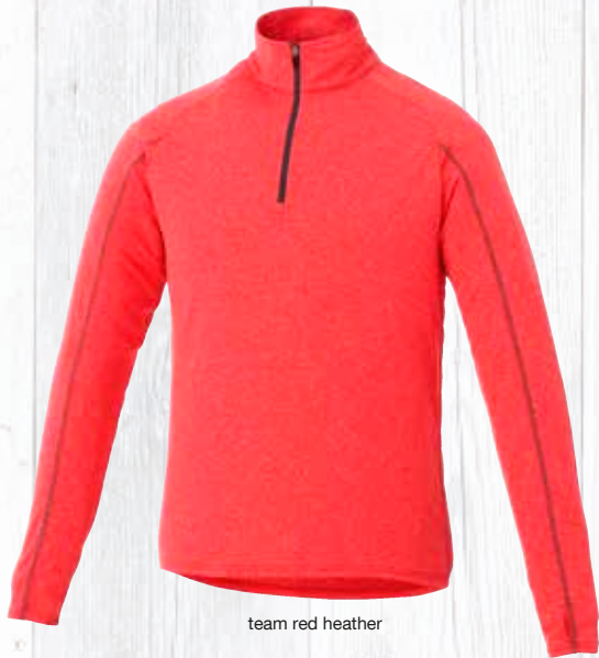
team red heather