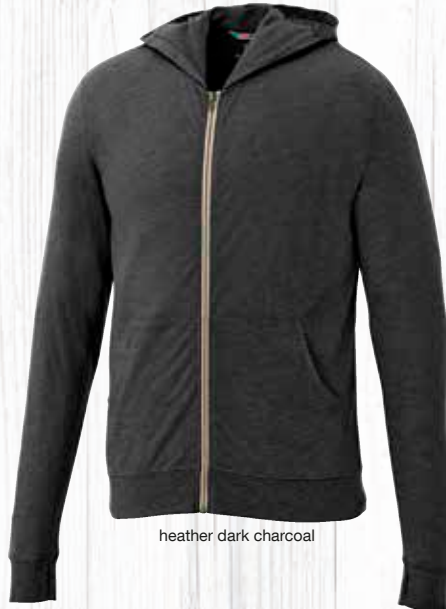
heather dark charcoal