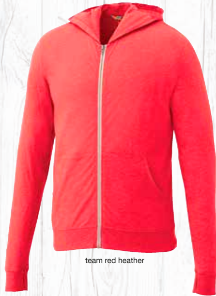
team red heather