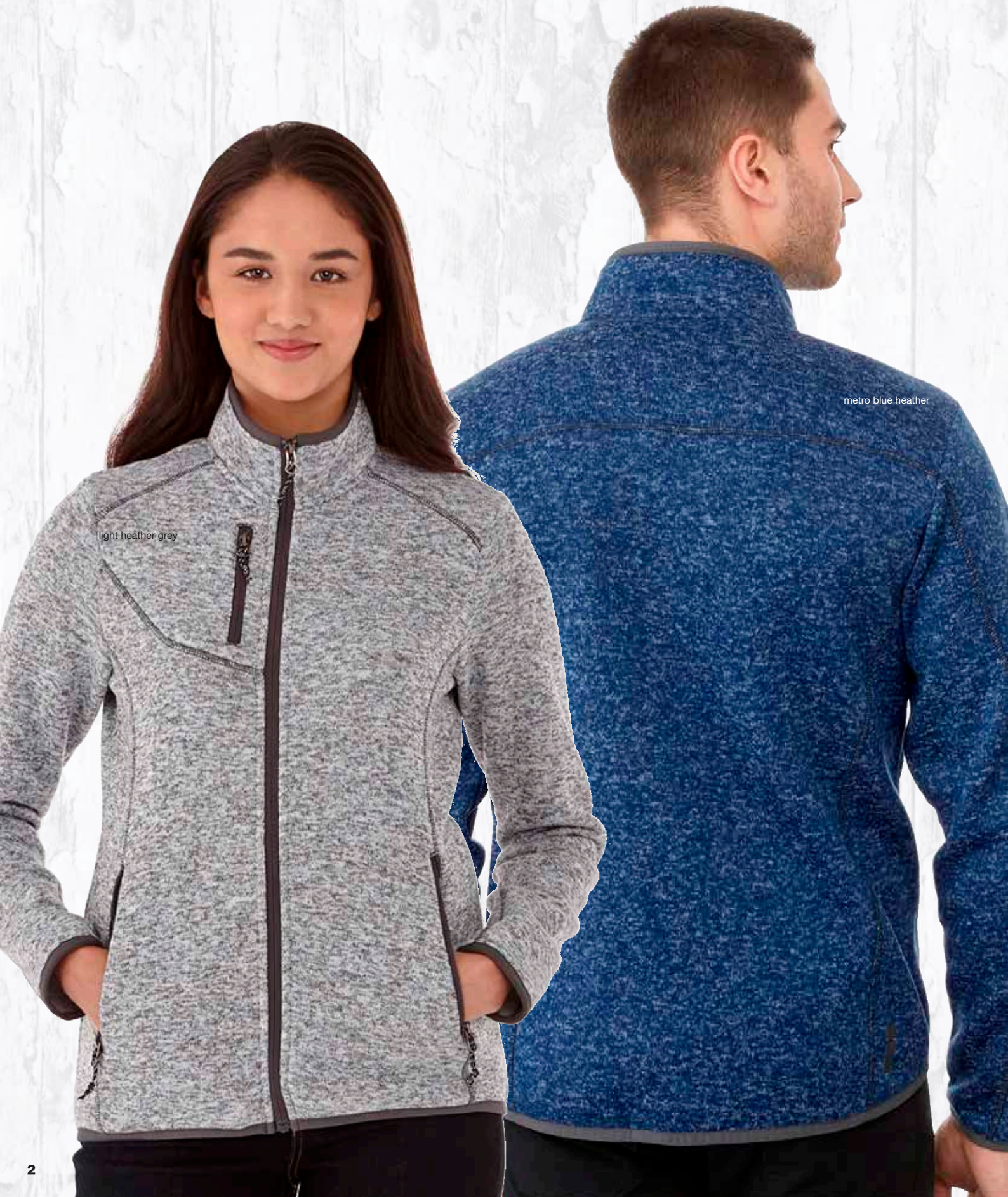
light heather grey