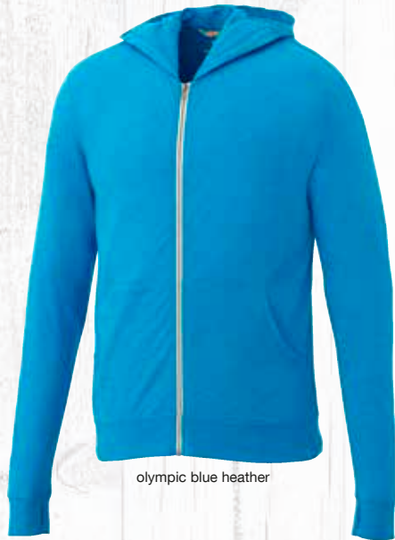
olympic blue heather